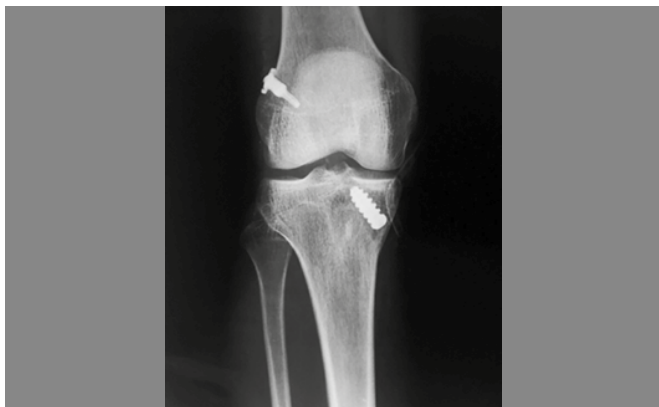
Figure 3. Postoperative anteroposterior radiograph of a right knee subjected to ACL reconstruction showing femoral fixation with the ETD®.