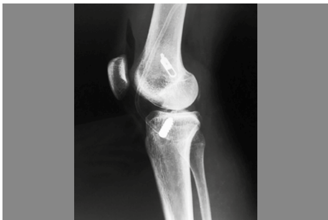
Figure 4. Lateral radiograph of the same case as in Figure 3.

degrees, and the guide wire was then passed until it crossed the femoral lateral cortical area. The femoral tunnel was subsequently drilled with the respective drill bit. Figure 5 shows an example of both ACL positions, marked from transtibial and transportal techniques.