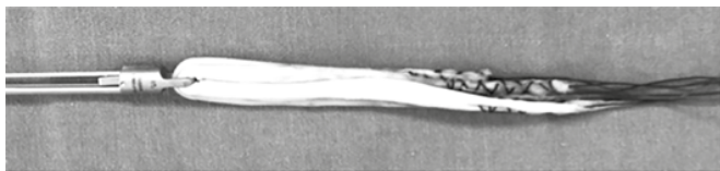
Figure 2. ETD® with the prepared graft (semitendinosus and gracilis tendons).

The tibial tunnel was drilled with the knee in extension, using the guide in extension (65° Howell Guide®; Biomet Sports Medicine Inc., Warsaw, IN). For the femoral tunnel, TT group, a conventional transtibial femoral guide (aimer) was placed on the posterior edge of the intercondyle. Before passing the guide wire (Kirschner 2.4), the guide was turned distally to reach a more horizontal position. For the AM group, the anterolateral portal was performed laterally to the patellar tendon, and the anteromedial portal was performed inferior and between the medial femoral condyle and patellar tendon to allow femoral tunnel drilling with no cartilage injury of the medial femoral condyle. With the knee at 90 degrees of flexion and the arthroscope on the lateral portal, an ice pick was introduced, and the center of the native ACL (anatomical positioning) was marked. Next, the positioning was checked with the arthroscope through the anteromedial portal. The guide wire (Kirschner 2.4) was introduced and positioned on the previously marked point, the knee was flexed between 120 and 130